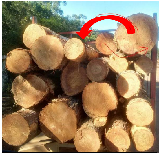
By rolling this one log into the middle would result in a better looking load.

I know this is not always easy to achieve with different log sizes and grades creating their own set of challenges. I am sure if loader operators / truck driver put their minds to it and keep an eye on this issue it will be eliminated.